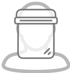
✗ Face shields