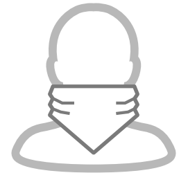
✗ Neck gaiters or buffs