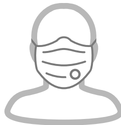
✗ Masks with exhalation valves or vents