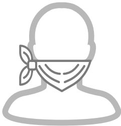
✗ Neck scarves or bandanas