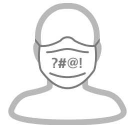
✗ Masks with inappropriate writing or images